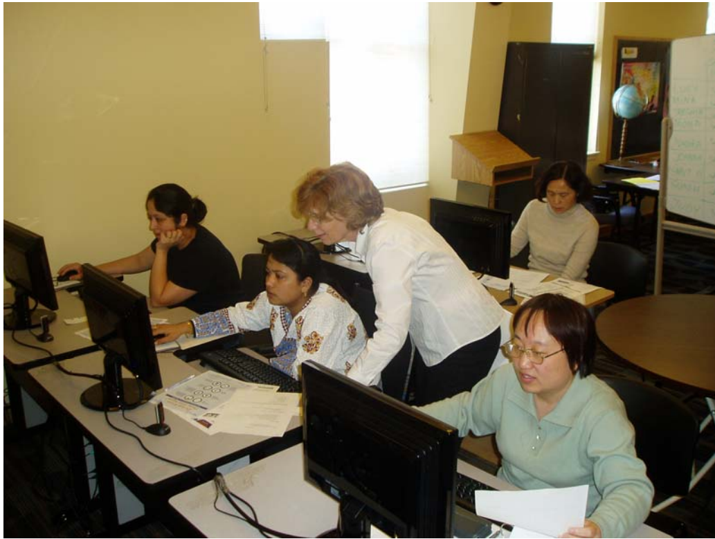
Workplace Hazardous Materials Information System On line course (WHMIS) All CCLD students received Certification April, 2008