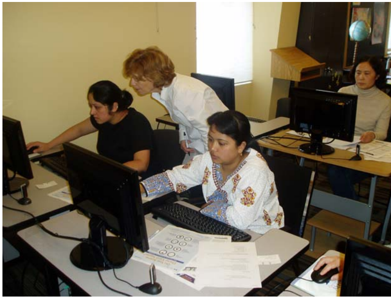
IWIP participants work on WHMIS Online Certification (Workplace Hazardous Materials Information System)