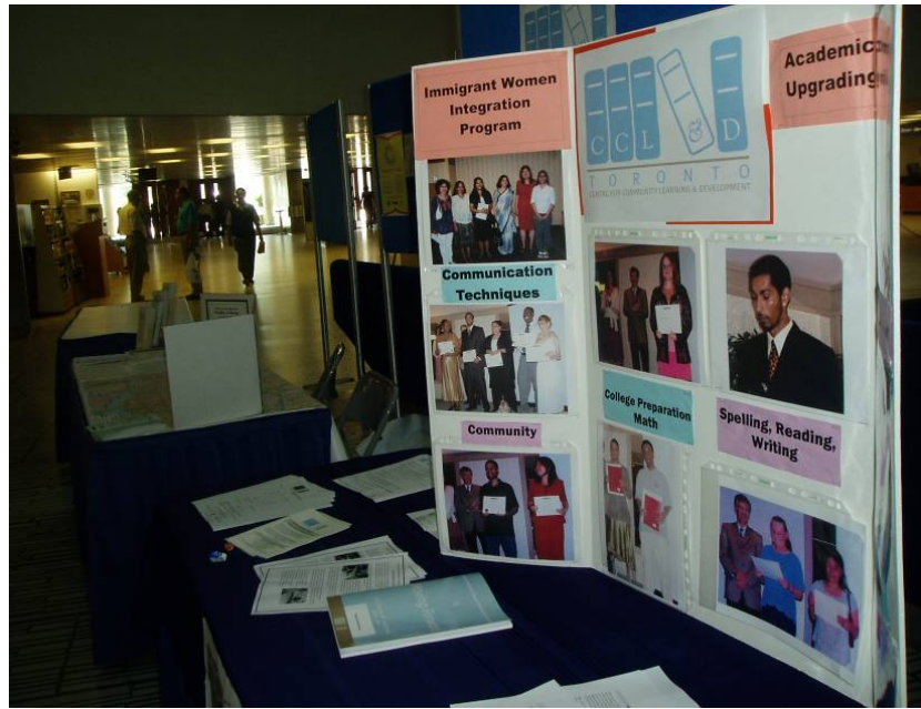
CCL&D at International Literacy Day 2007, Toronto City Hall