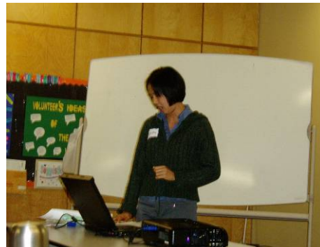
IWIP Participants delivering Community Needs Assessment (PowerPoint) presentations to Community Members