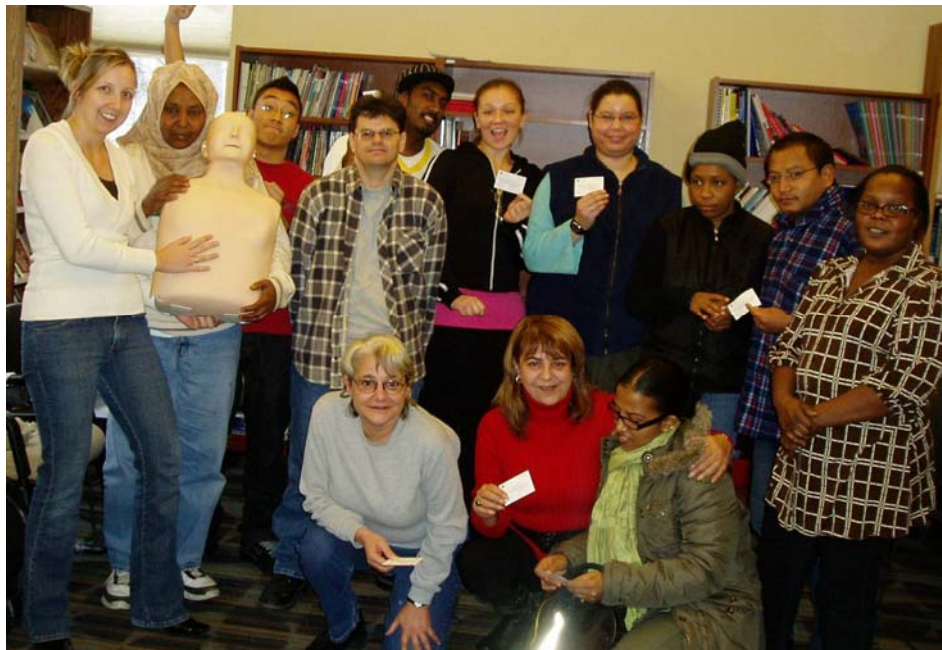
Academic Upgrading participants display recently earned Basic CPR Certification