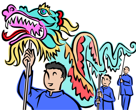
CHINESE LUNAR NEW YEAR

And that's why Toronto is so outstanding!!