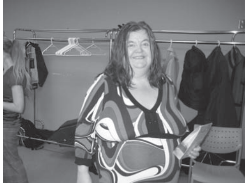
Celebrating National Volunteer Week with a potluck at Halifax North

If you come to my neighbourhood in the North End of Halifax this is what you would see. My street is called Brunswick Street. It has houses and apartment buildings. Some houses are over one hundred years old and they were built by wealthy sea captains and businessmen.