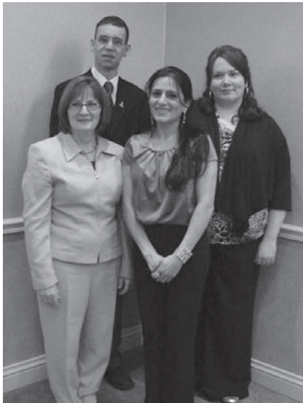
Prizewinning students at the Adult Learners' Week celebration at the Citadel Inn