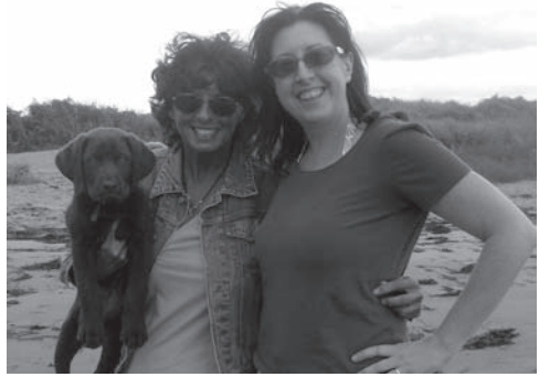
Enjoying a break from work with a day at the beach and a new puppy, Fuser