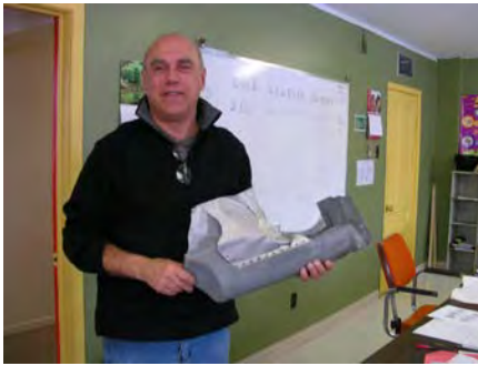
This is a piece of aircraft recovered from the crash site

In the summer of 2008 I went to Newfoundland. During those three weeks holidays, I took time to visit the plane crash site that occurred in Nut Cove at 4 a.m. on March 18, 1953.