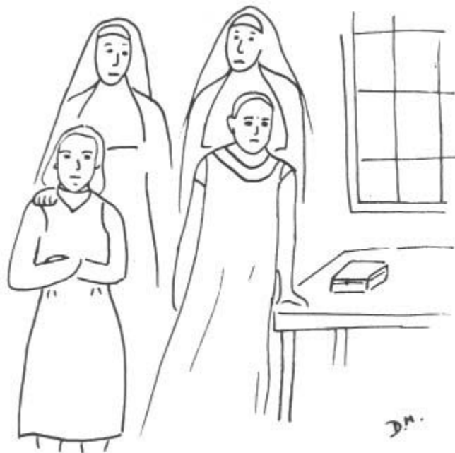
The Sisters with two leper children.

Life in the lazaretto continued to be very cheerless. Relatives did not come to the hospital often. The sick people had lost their families, homes, freedom and their looks. Near the end, the lepers were in great pain. Their minds were not physically damaged. Yet some of them had to be locked up. They would go out of their minds because they felt their lives were over. Some lepers even believed they were not cured because then there would be no reason to keep the hospital open.