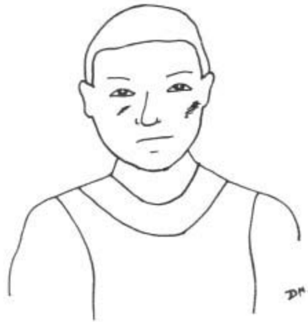
A young leper patient