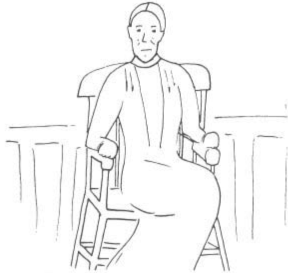
A Leper Patient