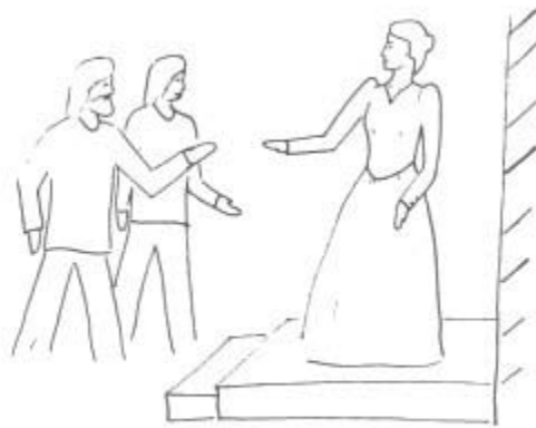
Ursule Landry talking to two lepers.

For the next fifteen years, the disease continued to spread in Tracadie. As many as twenty people lived in small two and three- room houses. It is little wonder that the disease spread as quickly as it did. By 1844, nine people had died from "Ia maladie." The Government of New Brunswick had done nothing up to this point. However, they decided to act when trade with other parts of Canada began falling off because of the fear of leprosy.