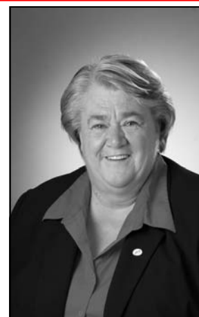
Hon. Claudette Bradshaw, Minister of State, Human Resources Development

When the Minister held a series of Roundtables in 12 cities and towns, Laubach was represented at 4 locations: Vancouver, Edmonton, Moncton and Halifax. In late June, the National Office also sent the Minister details of the innovative ideas Laubach Councils had provided in writing when the tour was first announced.