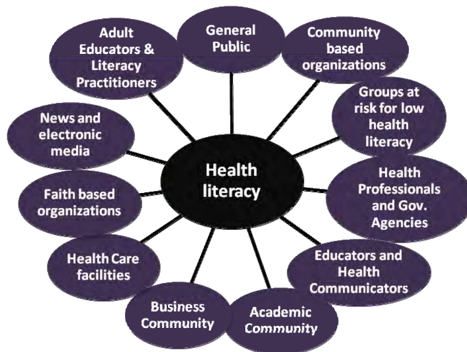
Figure 1. Major stakeholders involved in health literacy

Improved health literacy can contribute to more informed choices, reduced health risks, increased prevention and wellness, better navigation of the health system, improved patient safety, better patient care, fewer inequities in health, and improved quality of life. Health literacy applies to all individuals and all health systems (organizations). To illustrate: